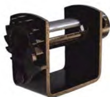
Standard Weld-In-Place Part No. 5510