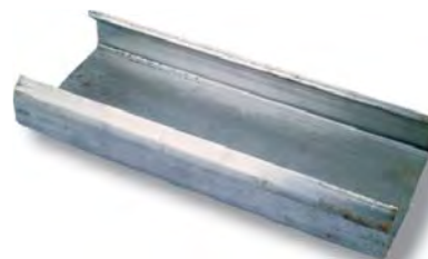
Winch Bar Painted & Knurled Handle Part No. 5542