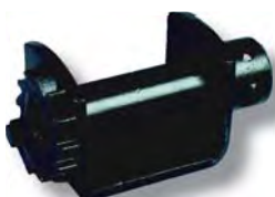
Low Profile Weld-In-Place Part No. 5511