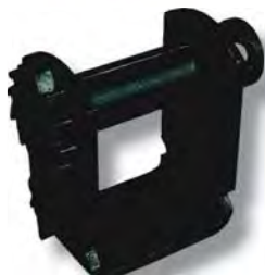
Standard Sliding Part No. 5515