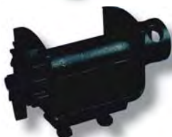
Low Profile Portable Part No. 5514