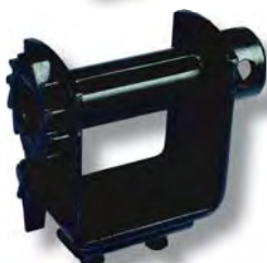
Standard Portable (2 Set Screws) Part No. 5513