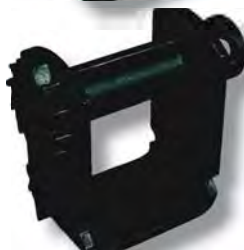
Deep Storable Sliding Part No. 5516