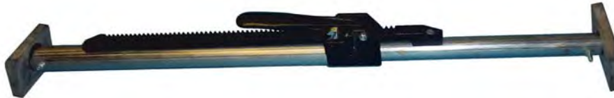
GRIP-TITE® Bar Steel, Adjusts from 89” to 105” / 9.4 lb ea. Part No. 5814S

The GRIP-TITE® Bar, with a rubber foot pad on each end, expands to fit tightly against the sides of the trailer.