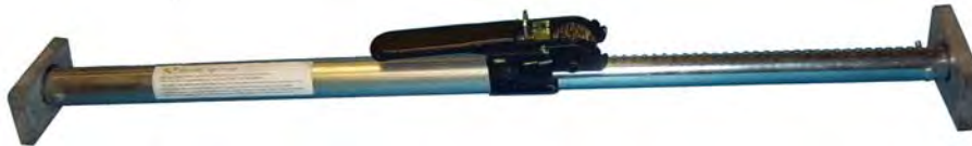
Ratcheting GRIP-TITE® Bar Steel Ratcheting, Adjusts from 89” to 105” / 9.4 lb ea. Part No. 5814SR